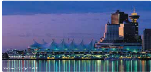
Vancouver city scape at dusk