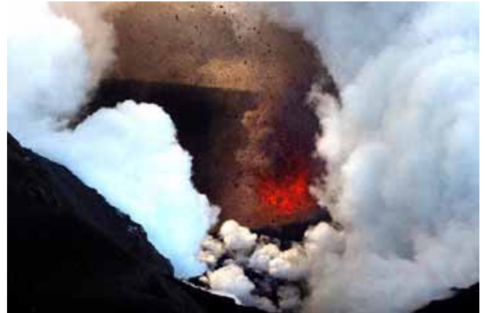
Iceland's Eyjafjallajokull volcano provided spectacular photography, but was also the cause of a lot of heartache