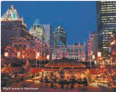
Night scene in Vancouver