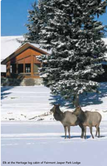
Elk at the Heritage log cabin of Fairmont Jasper Park Lodge