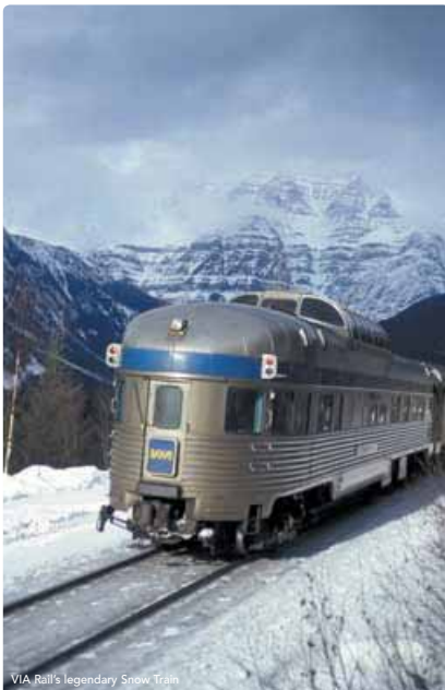
VIA Rail's legendary Snow Train

Discover Western Canada's most inspirational places at the most magical time of year – enchanting snow-covered national parks, vibrant cities and heartwarming festivities are yours to experience.